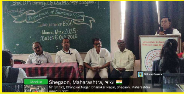
पर्यावरणशास्त्र विभागातर्फे आयोजित वन्यजिव संरक्षण सप्ताह