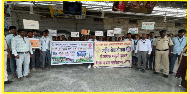
रेल्वे स्टेशन शेगांव येथे स्वच्छ भारत अभियान राबवितांना रासेयो स्वयंसेवक