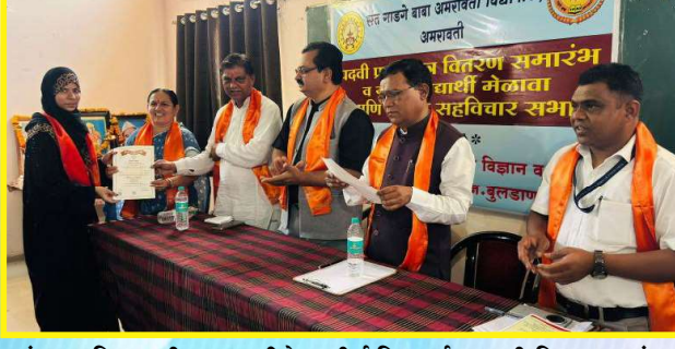
संगाबाअवि उन्हाळी २०२५ परिक्षेत उत्तीर्ण विद्यार्थ्यांचा पदवी वितरण समारंभ