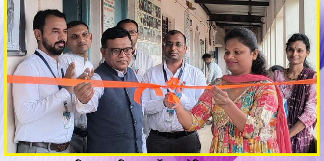
सुक्ष्मजिवशास्त्र विभागातर्फे आयोजित अन्न सुरक्षा व स्वच्छता कार्यशाळेचे उद्घाटन