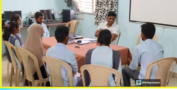
संगणकशास्त्र विभागाच्या वतीने आयोजित एकदिवसीय ट्रेनिंग व इंटर्नशिप कार्यशाळा दि. २८ जुलै २०२५