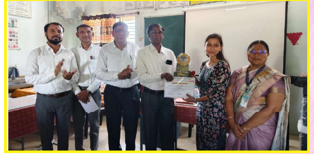
MBSI व सुक्ष्मजिवशास्त्र विभागाद्वारे आयोजित "ताक प्या व निरोगी राहा" कार्यशाळा