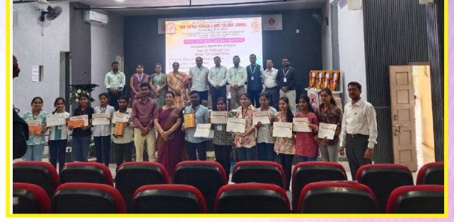
विद्यापीठस्तरीय प्रकल्प प्रदर्शनी मध्ये इलेक्ट्रॉनिक्स विभागाचे पारीतोषिक पात्र विद्यार्थी