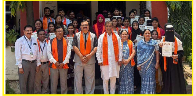
संत गाडगे बाबा अमरावती विद्यापीठातर्फे घेतलेल्या उन्हाळी २०२५ परिक्षेमध्ये उत्तीर्ण पदवीधारक विद्यार्थी, मान्यवर व प्रमुख अतिथी