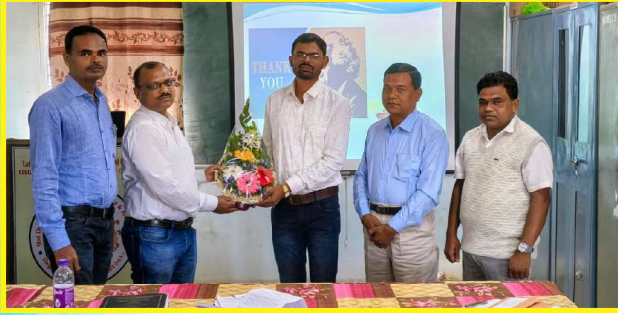
गणित संशोधन केंद्राद्वारे पि.एचडी पदवी प्राप्त संशोधक