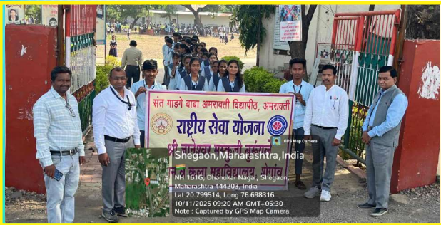
शेगांव शहरामध्ये आयोजित स्वच्छता अभियान रॉलीमध्ये सहभागी रासेयो स्वयंसेवक